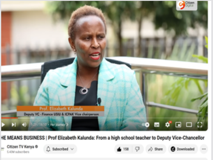
Citizen Tv “She means Business”