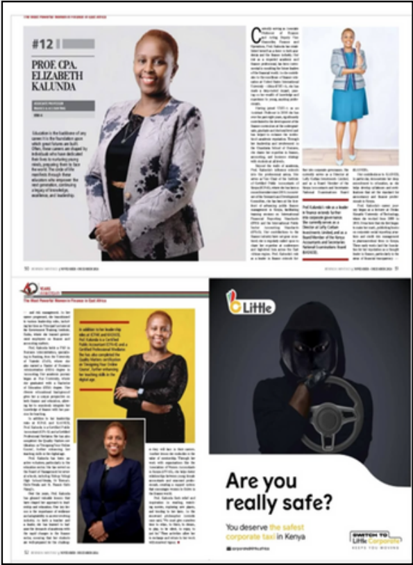
The Most Powerful Women in Finance in East Africa by the Business Monthly Magazine on Nov 2024 issue